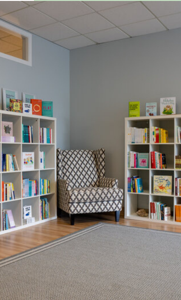
Healing Spaces Office in Kamloops, British Columbia

Our team of counsellors are well trained and experienced in multiple areas of counselling with different specialties. We offer in person and virtual counselling options, which allows our team to support you from the comfort and safety of your own home.